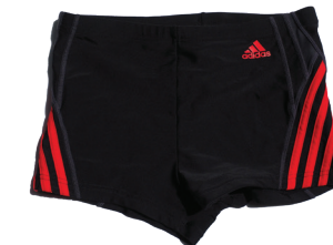
Long Swim Briefs