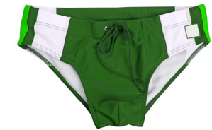
Short Swim Briefs