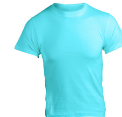
Short-Sleeve Rash Guards