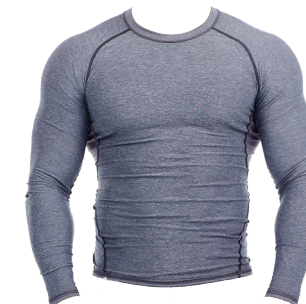
Long-Sleeve Rash Guards