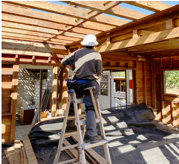
Lane County deconstruction project