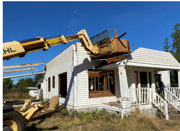
Lane County deconstruction project