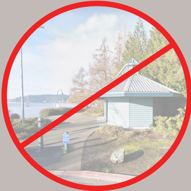
North Restroom and North Park