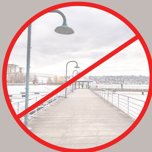
North Water Walk and Finger Piers