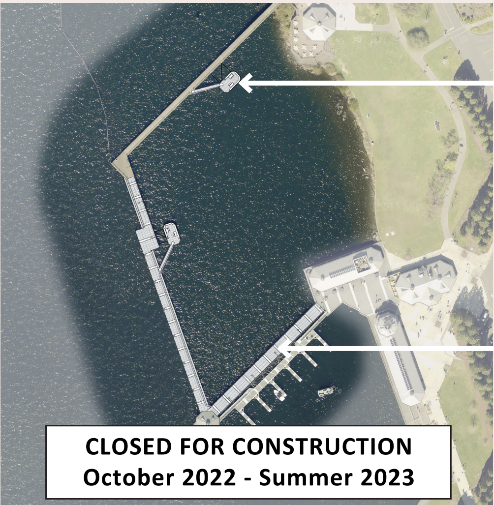
Refurbished Picnic Floats