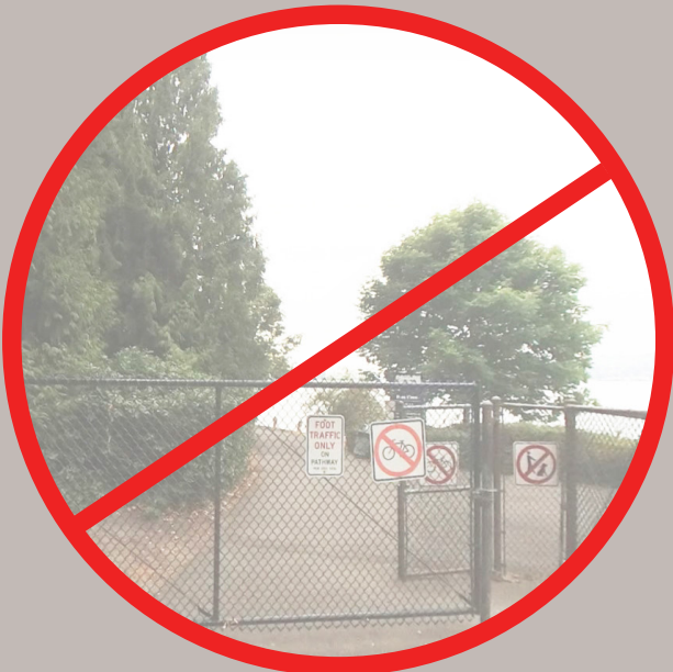
North Pedestrian Entrance